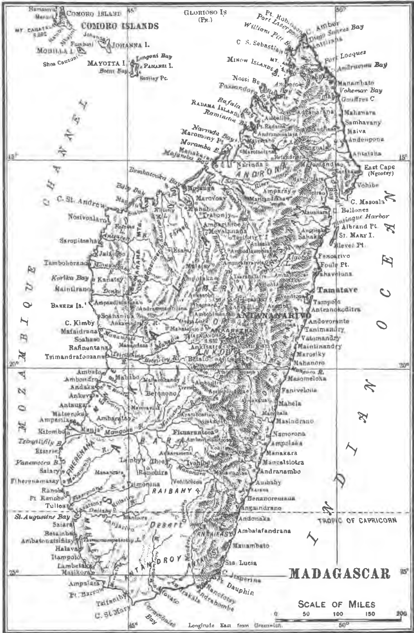
FIGURE 1.—MAP OF MADAGASCAR

Reproduced by permission from Rand-McNally's Atlas of the World