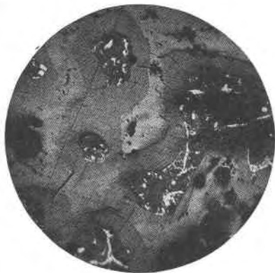
FIG. 3. Cores of stromeyerite (which has totally replaced tennantite) and native silver, surrounded first by galena and then by chalcopyrite. Vugs like the one represented by a black spot on the right ordinarily contain stromeyerite and silver. \times 60 (Photo by M. N. Short and R. W. Goranson).

With the stromeyerite, native silver is almost universally associated, cutting it in veinlets and growing from it in wires within the vugs. The attack by the corrosion which accompanies the development of stromeyerite may be likened, to use an unpleasant analogy, to the decay of a tooth where the enamel is left mainly intact but the core of less resistant material succumbs.