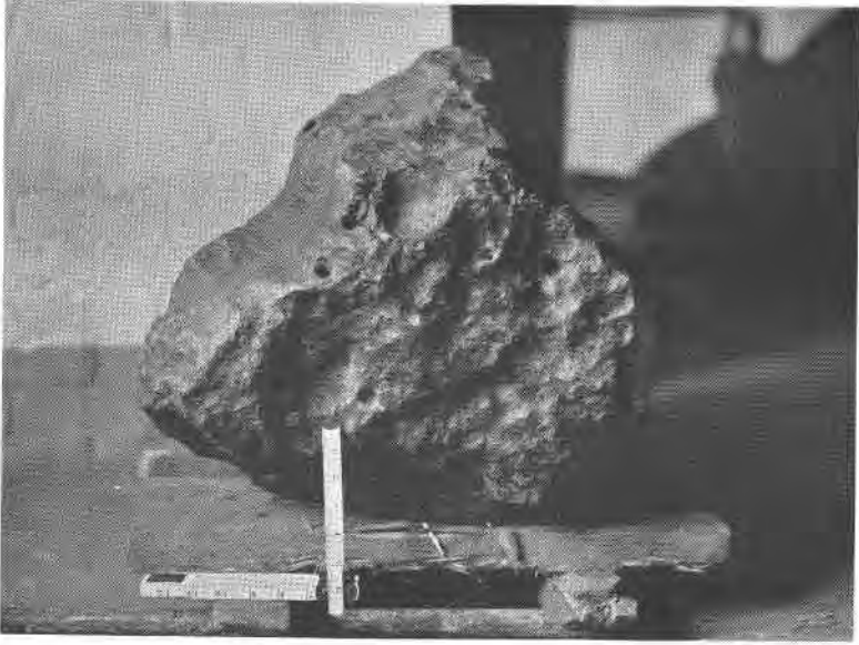
PLATE 1. Iron Meteorite from Carbo, Mexico.