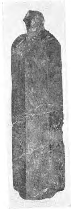
FIG. 2. Large, twinned crystal of titanite, with small, terminal individual in parallel growth, from lot 14, concession VII, township of Calvin, Nipissing district, Ontario. ( \frac{1}{2} Natural size).

At the McDonald mine, near Hybla, Ont., which has yielded so many interesting rare-element minerals, brown titanite in