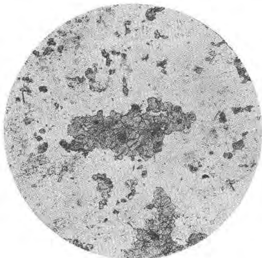
FIG. 2. Photomicrograph showing a "glomeroblast" composed of granular hedenbergite in a matrix of granular anorthite.

by iron oxide and magnesia. The hedenbergite, however, has an unusually deep green color, and it may possibly contain more iron than is indicated by the formula \text{CaO} \cdot \text{Fe}_2\text{O}_3 \cdot 2\text{SiO}_2 . If this be assumed, the change to actinolite, \text{CaO} \cdot 3(\text{Fe}, \text{Mg})\text{O} \cdot 4\text{SiO}_2 , becomes almost a simple paramorphism. Certainly there is no petrological evidence of addition or subtraction of material during the change.