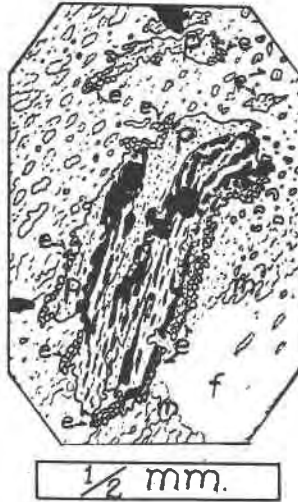
FIG. 3. Showing a flake of altered biotite in the metamorphosed volcanic rock. e=epidote; f=feldspar; m=mica (secondary biotite); p=piedmontite; black is manganese oxide.

The piedmontite in both sections occasionally contains minute inclusions. In some cases, these appear to be quartz, similar to that of the groundmass; in other cases there are lines of round, or oval-