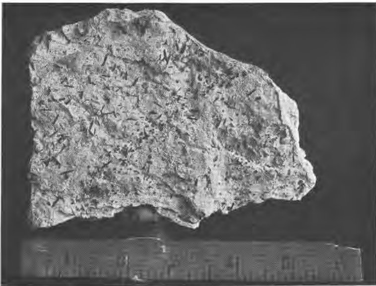
FIG. 2. Photograph of a specimen of joaquinite. The black dots are joaquinite crystals, the needles neptunite, the triangular crystals, benitoite. San Benito Co., Calif.