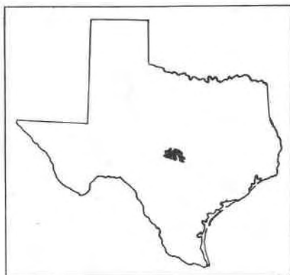
FIG. 1. Outline map of Texas showing location of crystalline rocks composing the Central Mineral Region.

The Baringer Hill pegmatite lies near the eastern edge of the Central Mineral (Llano) Region (Fig. 1) about 100 miles northwest of Austin, Texas. The nearest towns of any consequence are Burnett, 16 miles east, and Llano, about 22 miles southwest. Access to the pegmatite is by way of a country road from Bluffton, a settlement on the Burnett-Llano highway, about four miles northeast of Baringer Hill. However, this very interesting area is shortly to be submerged due to the development of a hydro-electric project. 1