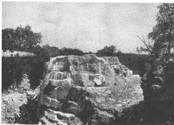
FIG. 3. Barren quartz pillar near center of Baringer Hill pegmatite.

thick tabular individuals up to 10 cm. in length and in coarsely granular masses. Microcline, when present, is decidedly subordinate. Quartz occurs abundantly in the red rock in both irregular grains and elongate crystals. The latter tend to parallel the tabular albite crystals, giving the rock a graphic texture, which does not approach the perfection of the peripheral rock, however. Thin sections of the graphic red rock show the presence of albite lamellae, in part transverse to the tabular albite. The writer believes that this transverse albite is older albite which was present in the mi-