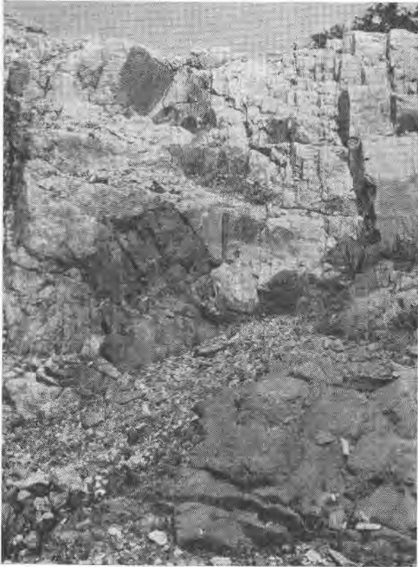
FIG. 2. Microcline crystal surrounded by quartz.

The normal pegmatite consists of milky quartz and perthitic microcline. The latter often exhibits square outline (Fig. 2), and continuous cleavage faces extending several feet may be observed. The microcline is visibly perthitic and the percentage of albite is materially greater than in the graphic granite microcline. Some of the