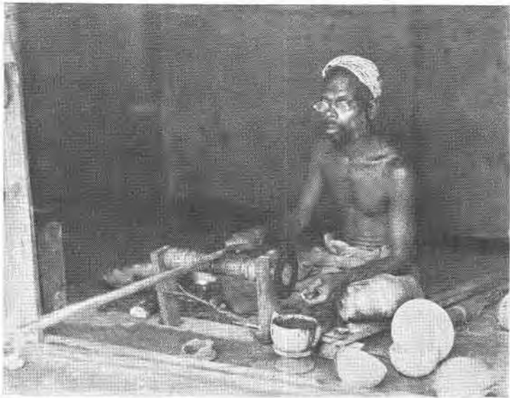
FIG. 2. A lapidary at work in Ceylon.

Stones are sold at auction in the bazaars, principally at Ratnapura, on special days. The gem dealers are said to be "moormen," that is, Tamils converted to Mohammedanism who have migrated to Ceylon from India. Ratnapura is also the center of much lapidary work, although by no means all of the stones are cut before they are sold. The lapidary work is exceedingly prim-