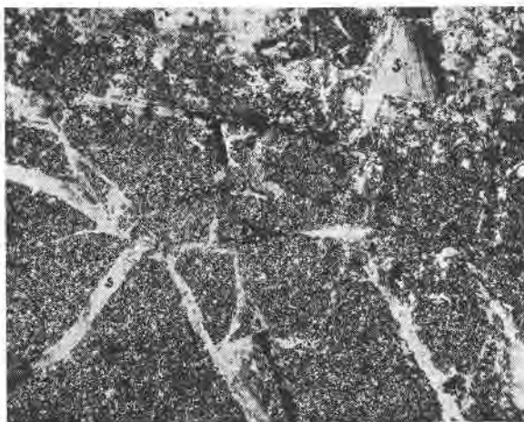
FIG. 3. Photomicrograph showing strontianite (s) filling fractures in and replacing a chert nodule. Crossed nicols. \times 22

of primary sulphate minerals associated with ore deposits that was discussed by Butler 7 some years ago. He cites numerous occurrences with conclusive evidence that such minerals as barite, alunite and anhydrite are undoubtedly primary constituents in some mineral deposits. Landes 8 and Spence 9 have both recorded the occurrence of celestite which they believe to be of hydrothermal origin rather than concentrated by the action of meteoric waters. The occurrence of primary celestite, however, is not nearly so common as in the case of barite or alunite. On the other hand, celestite formed by