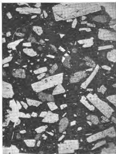
FIG. 1. Thin section of latite about 2 miles east of Vallecito, Big Trees Quadrangle, California. This section served for part of the measurements used in figures 2, 7 and 8. \times 24 .

The rock differs little from place to place, a fact also attested by earlier observers. The feldspar phenocrysts vary greatly in size, a few attaining maximum dimensions of half an inch or more. They are mostly euhedral tabular to (010). Other prominent forms are (001), (110) and (1 \bar{1} 0). All crystals show many times repeated