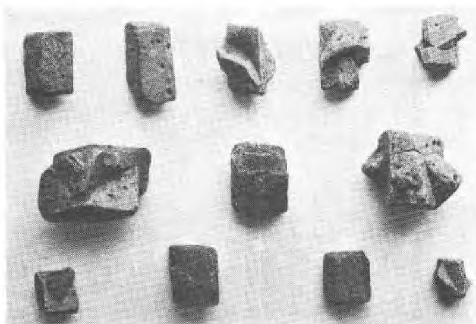
FIG. 1. Crystals of staurolite weathered from the staurolitic schist, Henry and Patrick Counties, Virginia. (Reduced \frac{1}{3} .)