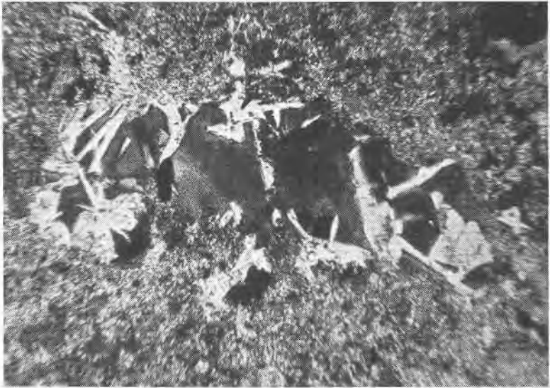
FIG. 1. Magnification 85 \times .

In the course of microscopic examination of some Miocene volcanic rocks southwest of Ouray, Colorado, abnormal forms of quartz were observed which are believed to be the result of inversion from tridymite and cristobalite. The paramorphic quartz occurs in the Burns quartz latite and associated rocks, two miles west of Red Mountain.