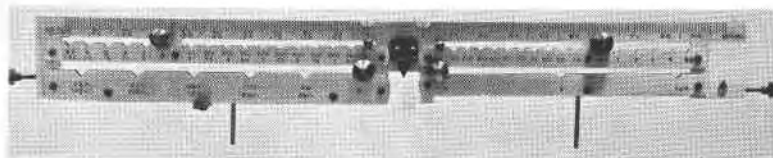
FIG. 1. The balance beam showing the arrangement of the notches and riders adopted in order to avoid the use of loose weights in specific gravity weighings.

Weight in air is obtained on the left-hand side of the balance beam and loss in water on the right-hand side of the beam. Dividing the weight in