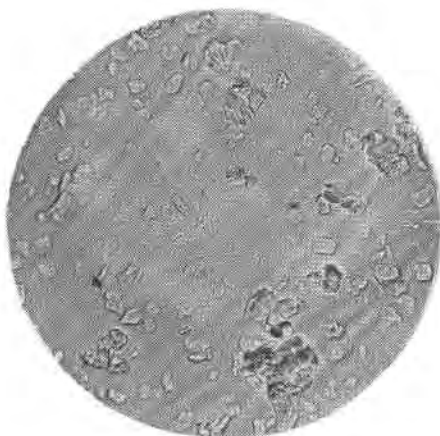
FIG. 2. Photomicrograph of dickite in geode from St. Louis Co., Mo. \times 146 .

The dickite is snow white and has a distinctly glistening appearance. Under the microscope many of the cleavage flakes have the typical hexagonal shape of dickite (Fig. 2). The maximum diameter of the