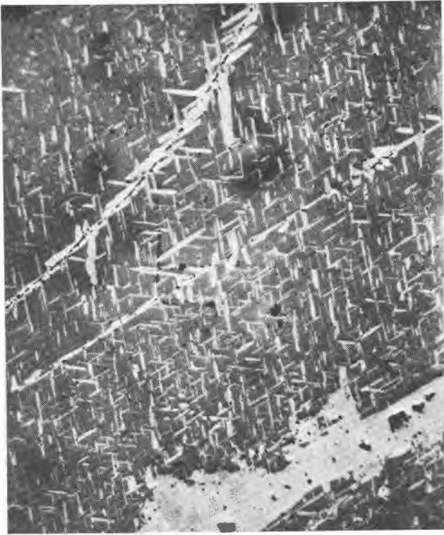
FIG. 3. Another polished surface of a partially oxidized fragment from the Nigger Hill Mine. \times 740 . One octahedral separation plane crosses the photograph running NE-SW. Above it a curved fracture shows. In this as in the other photographs it can be seen that the short lamellae of hematite produced by the oxidation provide a key to the orientation of the magnetite, and permit one to place an upper limit to the width of the outcrop of any possible twin lamella lying along a separation plane.

form orientation, and the angles of the outcrops of the hematite lamellae on this surface showed again that the two individuals were related to each other according to the spinel law. But, although each individual showed also a number of separation planes, there was no indication of polysynthetic twinning, and, since the surface separating the two individuals was not a plane, it was evident that this relationship was not secondary.