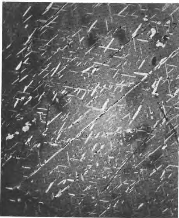
FIG. 2. Polished section of magnetite from the Nigger Hill Mine, U. S. Nat. Museum No. 11603, partially oxidized in air at 950^{\circ} – 1000^{\circ} . \times 740 . The bright portions are hematite, the ground is magnetite. The continuous narrow line of hematite running NE-SW marks an octahedral separation plane. The two parallel zones of more numerous short hematite lamellae, crossing the middle of the photograph nearly horizontally, mark the outcrops of two separation planes or potential separation planes parallel to the dodecahedron.

find any change in the orientation of the magnetite along one of these planes. There is always, of course, a layer converted to hematite, whose orientation cannot be found, but by controlling the oxidation this layer may usually be kept very thin. In the more favorable cases it was quite evident that if there had been any layer of magnetite, with an orientation different from that of the main body, the width of its outcrop must have been less than 0.001 mm. Yet in this work, as in the goniometric work, no evidence of polysynthetic twinning was found.