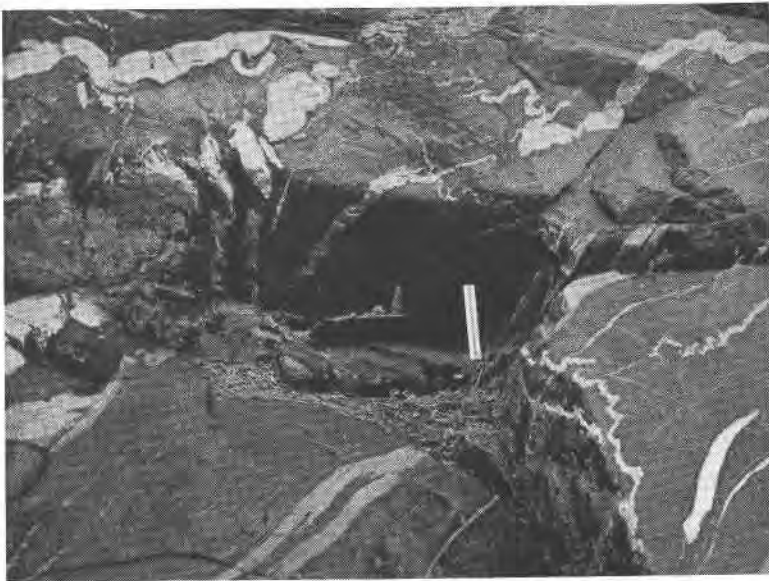
FIG. 1. Type I pegmatites in hornblende-schist, Phantom Creek. The great majority are approximately conformable with the schistosity of the country rock. A few are distinctly cross-cutting, and it is in these that ptygmatic folding is often conspicuously developed.

Aplites occur, and not infrequently, but they are vastly fewer in number, and bulk much less in the individual bodies, than do the pegmatites. Spurr (1923, 309–331), Olaf Anderson (1930) and others have discussed the relationship between pegmatites and aplites. There is much here that is still a puzzle; but the prevailing idea clearly favors a difference in viscosity, dependent in turn on a difference in the amount of volatiles as the essential difference between aplites and pegmatites.