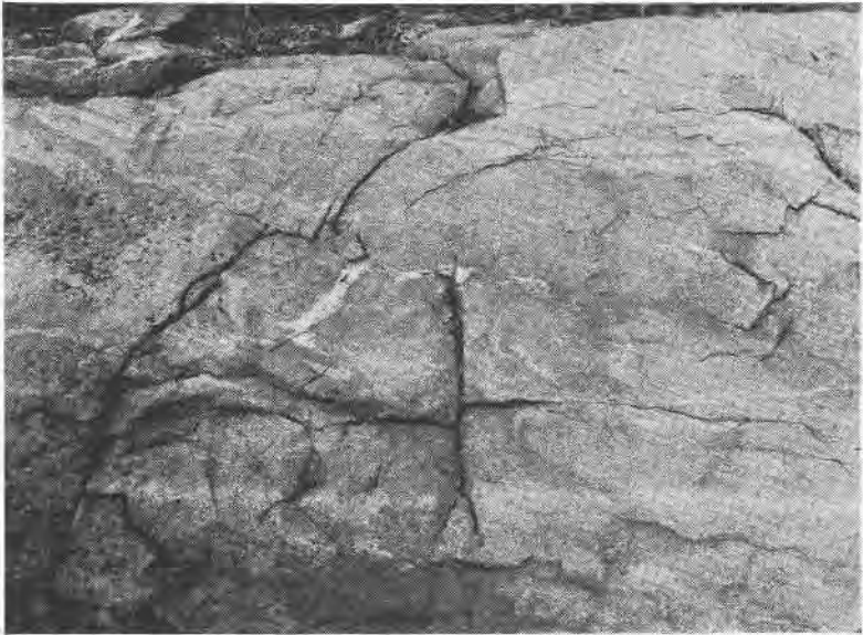
FIG. 3. Banded texture of mela-gabbro facies. Note late labradorite dikelets (white). Horizontal width of picture about 7 ft.

The plagioclase is a colorless bytownite close to Ab_1An_3 in composition. It occurs as polysynthetic twins after the albite law. Pericline twinning is not uncommon, but combinations of albite and Carlsbad twins are rare. Individuals average about 2 millimeters in diameter and attain