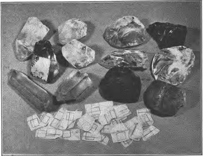
FIG. 2. Faced (left) and unfaced (right) masses of quartz of average size. The sawn wafers have 0.5 \times 0.6 inch blanks marked out thereon.

with machine tools and other critical materials. A number of these operations were bolstered with high priorities and financed with Government funds from the Defense Supplies Corporation. The phrase "priming the pump" was popular in Washington at this time. Most of the equipment was held in Signal Corps pools and allocated to the industry. While not crystal manufacturers themselves, the Galvin Manufacturing Corporation of Chicago coordinated more than 30 subcontractors located over