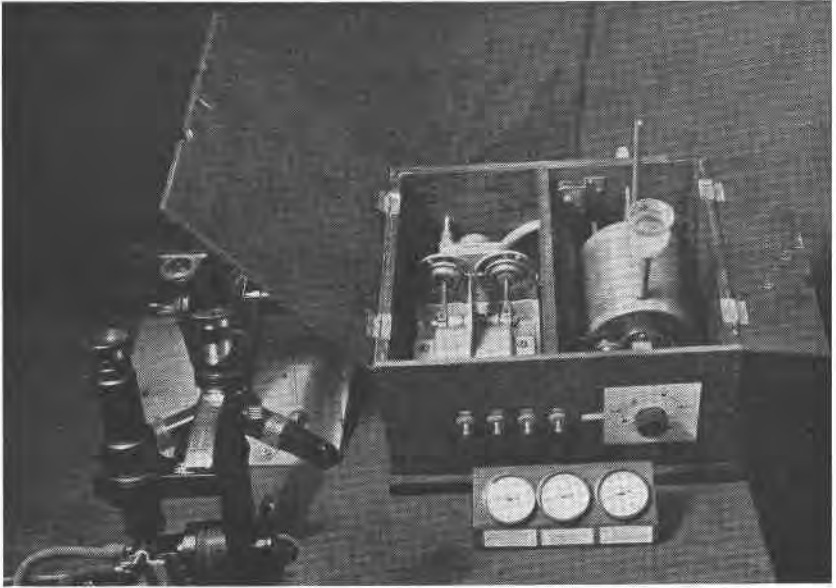
FIG. 2. Heating unit and pump.