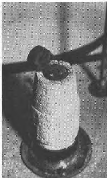
FIG. 1. Detail of removable sample block.

Bolivarite .— \text{Al}_2\text{PO}_4(\text{OH})_2 \cdot n\text{H}_2\text{O} , Ponte Verde, Spain, U. S. National Museum specimen R5594. Light gray-green powdery crust; isotropic, N=1.493 . Amorphous to x -rays. No chemical analysis. A strong broad endothermic reaction with a peak at 220^\circ\text{C} . (Fig. 2, No. 5) is the initial water loss. A sharp secondary endothermic reaction at 430^\circ\text{C} . is inter-