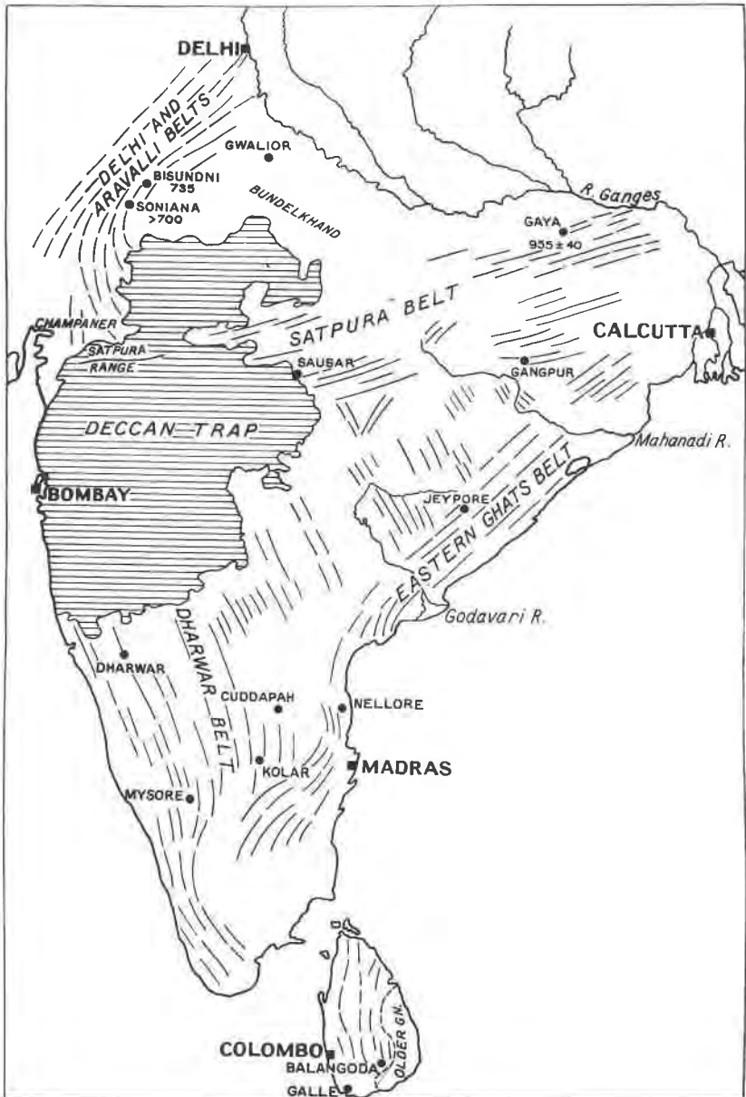
FIG. 1. Provisional tectonic map of the Pre-Cambrian orogenic belts of Peninsula India and Ceylon. The figures represent the ages of radioactive minerals in millions of years.