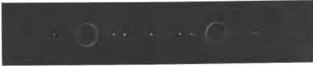
FIG. 2. Photograph of images of an illuminated pinhole as seen through an aragonite plate for seven selected positions of the crystal.

of their exact parallelism (in air), have zero intensity and contribute to the dark circles shown in Figs. 2 and 3. Each ray slightly inclined to those shown is doubly refracted and contributes light to point images. The points from the rays in a small cone which encloses the incident ray illustrated in Fig. 1 lie on the bright concentric circles, as can be demonstrated by Sylvester's construction. 2 Figure 2 shows the pinhole images for seven positions of the crystal. If the pinhole diameter is too large for the thickness of the crystal employed, the concentric rings are not resolved, and the pair is seen as a single ring. The light seen in either case has simply undergone double refraction. The rays which are truly conically refracted do not contribute to the image. The theory is correctly treated by Wooster 3 .