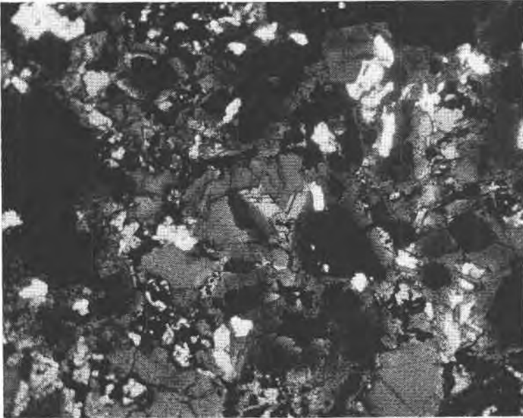
FIG. 3. Photomicrograph of North Carolina emery showing hoegbomite. V-shaped mineral in center is hoegbomite A passing marginally into hoegbomite B (dark rim). Prismatic hoegbomite B in upper right. Corundum (white), magnetite (black, opaque). The rest of section is made up of spinel (example lower right and lower left) and hoegbomite (example top center, right margin). \times 34 .

The North Carolina emery is very similar in composition to the New York and Virginia emery. Its chief mineral constituents are corundum, spinel (of composition near pleonaste), and titaniferous magnetite. Hoegbomite is common. Because of the deep weathering it was not possible to establish with certainty the nature of the rock in which the emery occurs. Outcrops of Roan gneiss, which in this area is of dioritic composition, were noted near emery occurrences.