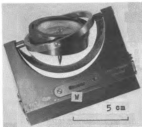
FIG. 3. Universal compass. W, water level.

In 1946, the writer drew the graph for the determination of linear schistosity which is very similar to Ingerson's. 6