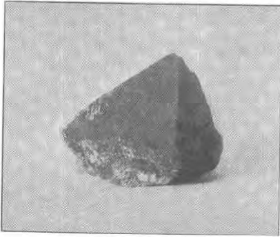
FIG. 2. MAGNETITE. \frac{5}{8} SIZE.