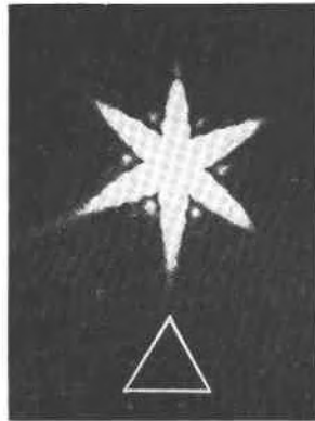
FIG. 3. Diffraction pattern of a triangular aperture.

In Figs. 1 and 2 above we have (1) a highly complex distribution which is preferentially arranged with respect to three directions which form