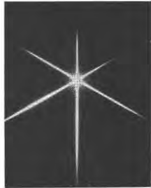
FIG. 2. Six-rayed star produced by a beam of light passing through the fractures of the magnetite shown in Fig. 1. The rays are perpendicular to the linear openings in the magnetite.

hedron face parallel to the cleavage plane of the mica. The trigonal lines representing open spaces between the crystal boundaries which may have been enlarged by 1 above or 3 below. (3) In the mining operations the flexing of the muscovite could have fractured the thin piece of magnetite along the octahedral directions and thereby divided the large flat grain of magnetite oriented with an octahedron face parallel to the cleavage, into many small pieces along the "parting" planes. If this were the correct answer one would expect a preponderance of cracks in one of the three particular directions as well as fractures extending across in irregular directions. It is quite likely that a combination of two or all of these factors may have contributed to development of the slits now present in the magnetite.