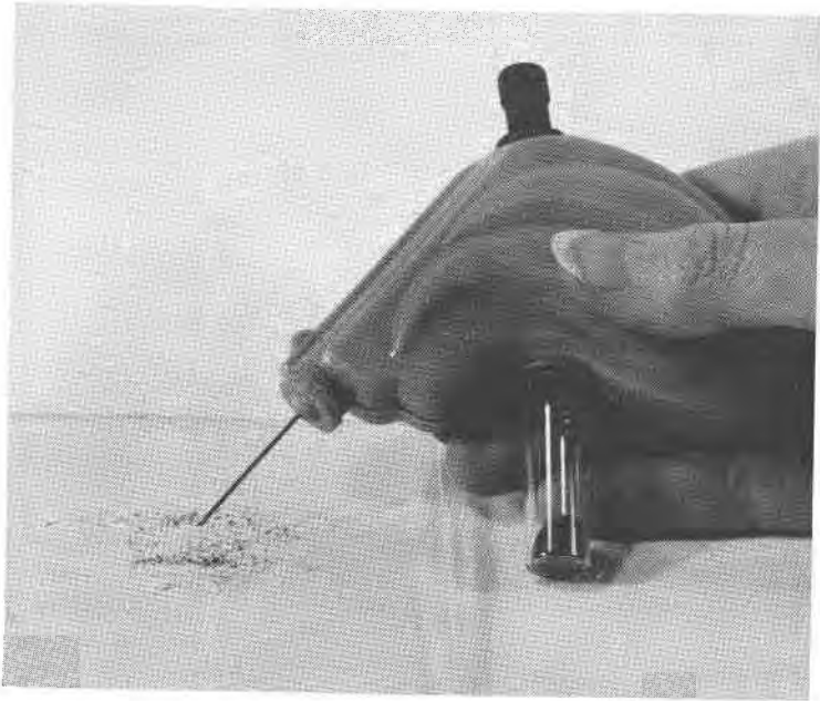
FIG. 2. Mineral-picking apparatus in use.

apparatus is inexpensive, easy to make, and has proved very useful in separating pure concentrates of zircons for age determinations.