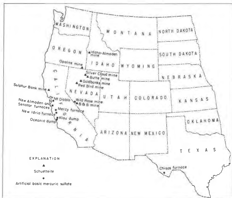
FIG. 1. Index map showing localities where schuetteite has been found, and showing other occurrences of basic mercuric sulfate.

widespread blanket of rock known as opalite, formed by the leaching and silicification of acid tufts or siliceous sediments. The opalite is cryptocrystalline, and the widely used name is a misnomer as chalcedonic quartz, rather than opal, is generally the predominant mineral. The cinnabar occurs as clouds of disseminated crystals, generally of minute size (Pollock, 1944, p. 2), in favorable layers or along feeder faults. Calomel, mercury oxychlorides, and native mercury have been found at the Opalite mine in Oregon and elsewhere, but they are not common in this