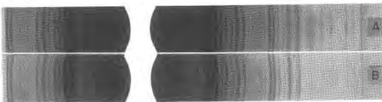
FIG. 2. X-ray powder films of pectolite. A, sample from section 32, T. 26 S., R. 15 E., Woodson County, Kansas; B, sample from Patterson, New Jersey.