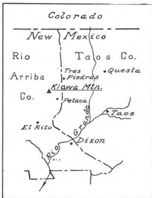
FIG. 1. Index map of north-central New Mexico, showing location of Kiawa Mountain. One inch equals about 14 miles.

described by Serdyuchenko (1949) and by Shabynin (1950). An occurrence in Lume Valley in the Ruwenzori Massif, Belgian Congo, has been described briefly by Thonnart (1954).