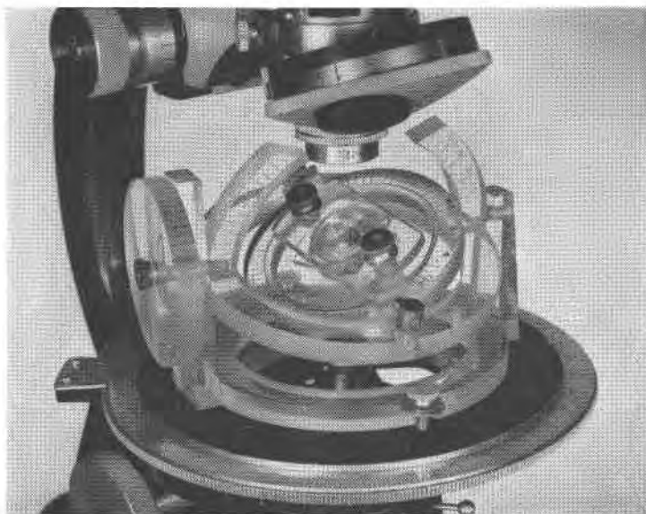
FIG. 2. The perspex stage, mounted on a Swift Model P microscope.

can be ground fairly cheaply, as precision is not essential, and all that is required is moderately clear vision through the upper segment.