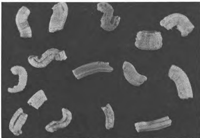
FIG. 1. Microphotograph of vermicular gibbsite, South River, New Jersey. \times 14