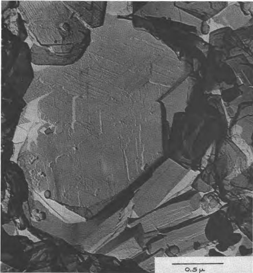
FIG. 3. \text{H}_2\text{SO}_4 -treated kaolinite showing reaction product "chains" on basal surfaces. \times 76,000 .

nature of these reaction products is unknown but unpublished x -ray and transmission electronoscopic work by Murray (1951) have shown that aluminum phosphates and aluminum sulfates form from kaolinites following acid treatments and drying at 110^\circ\text{C} . Using this work as a guide it is not unreasonable to assume that the particles shown in Figs. 2 and 3 are aluminum phosphates and aluminum sulfates respectively. The absence of x -ray evidence to support this is considered due to the very small particle sizes involved. In addition, poor crystallinity combined with the comparatively small amounts present would also inhibit coherent diffraction effects.