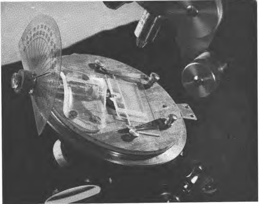
FIG. 1. The mounted spindle stage. The microscope has been fitted with a universal stage objective (Zeiss UD 20) for conoscopic observations.

interference figures unless some adaptation is made to the microscope substage. On some microscopes it is sufficient to remove the upper stop-screw from the condenser rack, thereby enabling elevation of the condenser lens. Alternatively an accessory lens may be inserted between the needle and condenser: the simplest such arrangement is replacement of the standard condenser by one designed for conoscopic work with the universal stage.