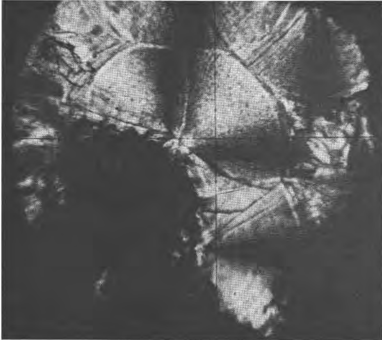
FIG. 4. Annular and acicular structures and spherulitic cross in leucophosphate. Area is 0.5 mm across.

Itabirite, the cave wallrock on and in which the leucophosphate was deposited, is a low-grade metamorphic oxide-facies iron formation, comprising alternating iron-rich and silica-rich laminae of hematite and very fine grained quartz, and may contain dolomite, magnetite, maghemite, and other minerals. The itabirite wallrock of the Serra do Tamanduá cave is exceptional in that the iron-rich laminae are composed mostly of