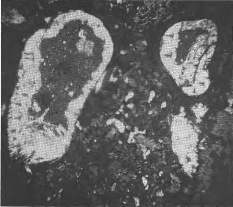
FIG. 2. Leucophosphite in cavities. Area is 1.5 mm across. The white areas are nearly pure leucophosphite. The black areas with rough or shiny surfaces are maghemite, martite, and magnetite. The dark-gray to black areas with metacolloidal structure, particularly prominent around the cavity at upper right, are mixtures of limonite, leucophosphite, strengite, and metastrengite. The gray areas in the central part of the two larger cavities are voids.

Leucophosphite occurs in a thin veneer on the itabirite wall of a cave, and lines and fills microscopic and small macroscopic vugs and cavities in