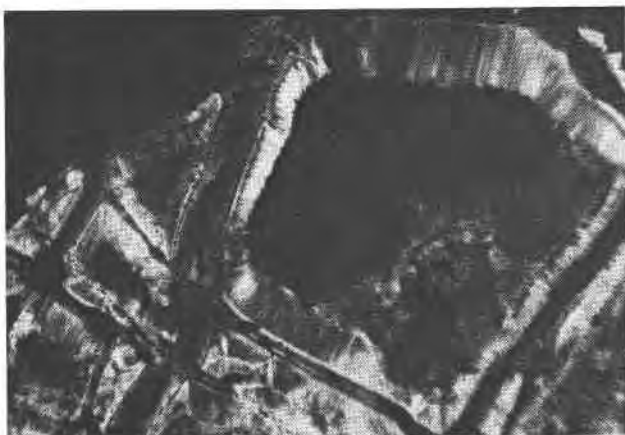
FIG. 3. Replacement of olivine (?) by clinochrysotile. Crossed polars, \times 210 .

comparing these photomicrographs with those by Faust and Fahey (1962).