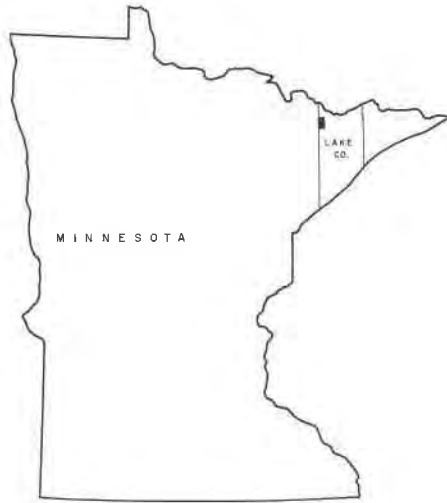
FIG. 1. Location map.

antigorite mixtures have grown obliquely across former irregular fractures. A photomicrograph of the clinochrysotile-antigorite mixture is shown in Fig. 2. The massive mineral shown is massive antigorite which is found cutting across the fibrous mixture. Clinochrysotile also has replaced an original essential rock-forming mineral (Fig. 3), most likely olivine. It can be noted that fibers in the mixture (Fig. 2) are much coarser than those replacing olivine (Fig. 3). Readers will be interested in