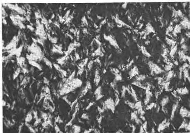
FIG. 4. Chamosite. Crossed polars, \times 210 .

The mineral considered to be chamosite in this paper is found in irregular masses having the appearance of fracture fillings. Chamosite consists of olive-green masses having the appearance of bent plates somewhat resembling slickensides. Microscopically, chamosite appears to consist of radiating fibers (Fig. 4). Chamosite and clinochrysotile-antigorite mixtures were not observed in contact with one another although the minerals were only separated by a few feet.