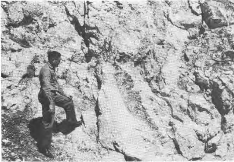
FIG. 2. Lenticular bodies of cleavelandite-lepidolite pegmatite (just east of lower center and behind man's shoulder) and cleavelandite pegmatite (in NE quarter), cutting quartz-microcline pegmatite of Brown Derby No. 2 dike. Note corroded microcline relicts (above man's knee). Cleavelanditic units lie at nearly right angles to strike of dike (essentially east-west of photograph).

2. Six-inch composite veins of lepidolite bands and cleavelandite bands in comb structure cutting across large microcline masses. Similarly, in