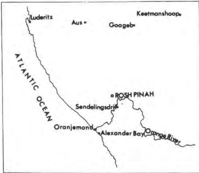
FIG. 1. The south-western corner of South West Africa showing the location of Rosh Pinah.