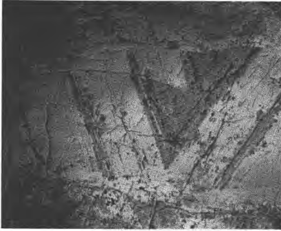
FIG. 1(A). Zoned wolframite crystal from near Alice Springs, N.T., showing interzonal exsolution of scheelite, \times 13 .

ite/ferberite ratios somewhat higher than determined by chemical analyses (Tables 1 and 2). This anomaly is apparently due to the presence of calcium in the ferberite structure, and not to the differing (hkl) -spacings adopted by Starke (1959) and the writer.