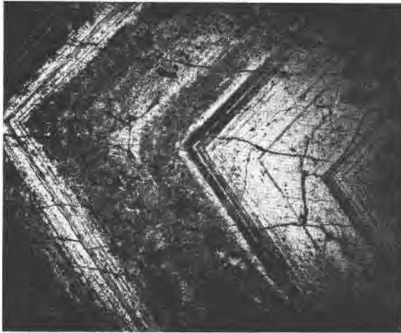
FIG. 1(B). Strongly zoned wolframite crystal after surface oxidation through heat treatment. Some fine interzonal scheelite exsolution lamellae again evident. \times 13 .

ite/ferberite ratios somewhat higher than determined by chemical analyses (Tables 1 and 2). This anomaly is apparently due to the presence of calcium in the ferberite structure, and not to the differing (hkl) -spacings adopted by Starke (1959) and the writer.