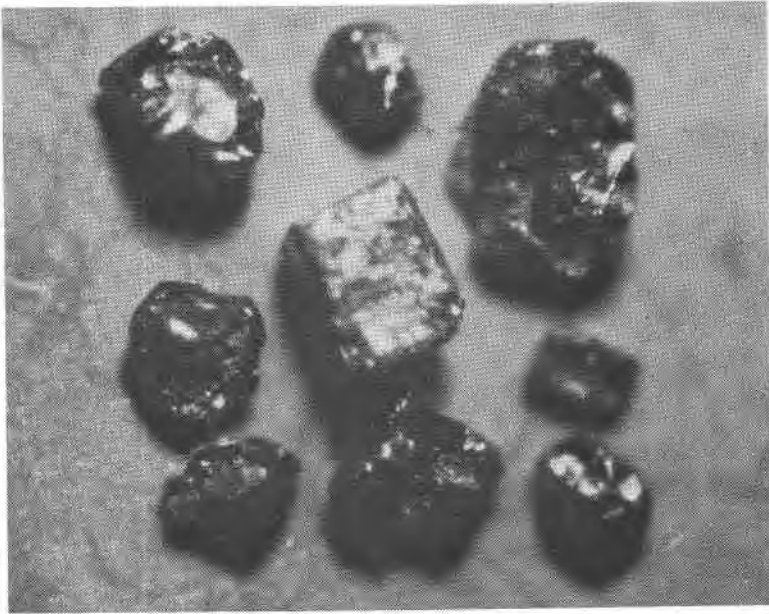
FIG. 1. Crystals of macedonite (100X).

(110), (101), and (111), the most common being crystals of prismatic shape. The grain-size is highly variable, ranging from a few tenths of a micron up to 0.2 mm; the most common sizes range from 80 to 100 \mu\text{m} .