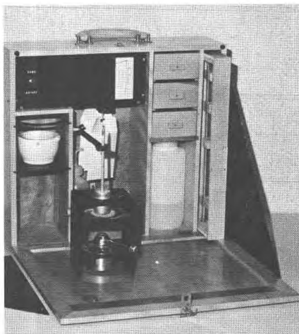
FIG. 1. Photograph of zeolite test kit.

The sample is ground in the mortar to below 14 mesh or 1 mm size. After zeroing the balance with the coin envelope suspended on the hook, 5 gm of ground sample are added into the envelope. The weighed sample is placed in the thin-walled aluminum container and heated to 350^\circ\text{C} over the burner with the mounted thermometer inserted midway into the sample (Fig. 1). When this temperature is reached, the sample container is removed with gloves or tongs from the burner, capped, and set aside to cool. For rapid cooling the sample container can be set in water. The cover is removed, and the temperature ( T_s ) of the sample is measured to within 0.2^\circ\text{C} . Ten ml of water at a temperature ( T_w ), preferably atmospheric temperature, are poured on the sample and the mixture is stirred quickly with the thermometer. The temperature of the mixture rises rapidly, reaching a maximum value ( T_{\text{max}} ) within 30 seconds, and then slowly drops to atmospheric temperature. A high temperature rise upon the addition of water is characteristic of the presence of zeolitic material in the sample, and the amount of temperature rise ( \Delta T ) is directly propor-