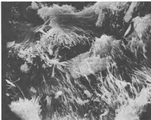
FIG. 2. Scanning electron micrograph of the Etna tuff showing mordenite needles approximately 0.1 \times 3 microns in size, enclosing what appears to be laths of clinoptilolite. Magnification = 650 X.

The continental sedimentary rocks in the northern part of the Atoyac River valley were mapped by Wilson and Clabaugh (1970) and dated by vertebrate fossils as Late Miocene in age. As described by