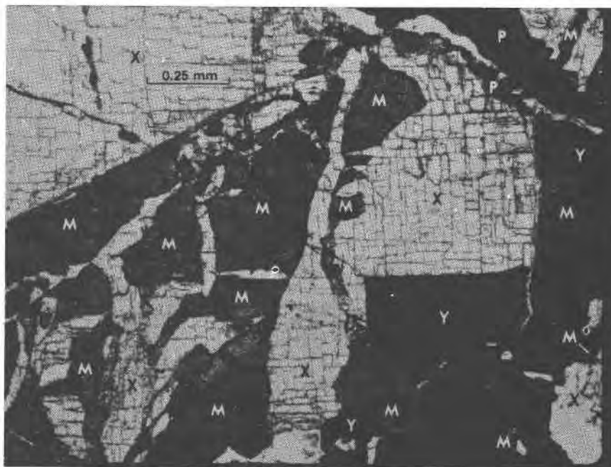
FIG. 2. Dissected murataite (M) crystal enclosed in xenotime (X). Black areas (Y) are mineral Y. Assemblage cut by narrow veinlet of quartz and pyrochlore (P). Transmitted light.

the Mount Rosa-type pegmatites. Genthelvitte, another zinc mineral, has been found in several pegmatites in the area, including the one in which murataite occurs.