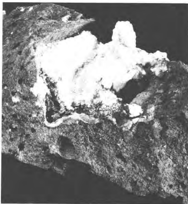
FIG. 1. Basalt containing white huntite in vesicles, the walls of which are lined with magnesite.

The basalts at Deer Park are part of the "newer basalts" which poured out over a greater part of Victoria in late Tertiary and Pleistocene times. They are exposed in two quarries from which rock is being won for concrete aggregate and road-making purposes. These basalt flows took place towards the end of the vulcanism and form part of a series of flows nearly 60 m thick between some of which there was a considerable interval of time. The upper part of the flow at Deer Park is gray in color and vesicular and can be described as an iddingsite basalt in which the olivine of the basalt has been altered to iddingsite at a late stage in the emplacement of the flow. The lower part of the flow is a dark green basalt in which the olivine and glass have also been deuterically altered to a green clay mineral. The boundary between gray and green basalt is very irregular and is usually marked by a transitional zone where the clay mineral of the green basalt has been oxidized. Overlying the basalt is a soil zone approximately 2.5 m thick that has at its base a discontinuous layer of magnesite nodules. Underlying it there is an extensive development of soil on an underlying basalt flow and a considerable development of hardened magnesite nodules about one meter below the surface of the fossil soil. The clay of the fossil soil has the appearance of being heated, and in the magnesite layer it frequently occurs as dried aggregates encased in a