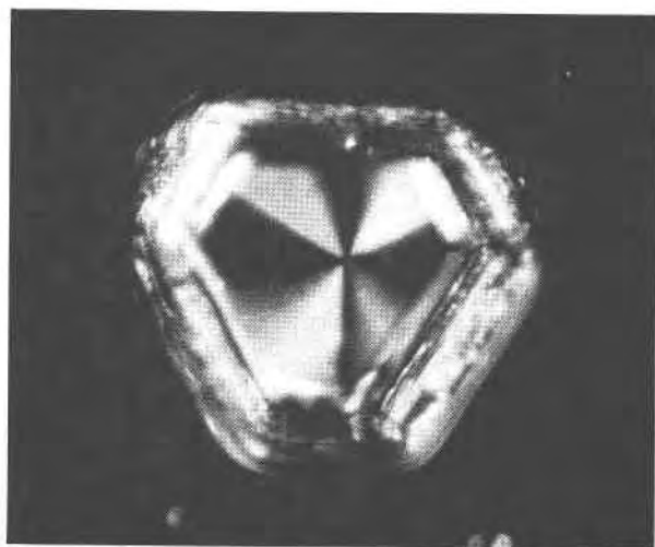
FIG. 2. Radial extinction pattern on (001) for amesite- 6R under crossed nicols. In contrast to the crystal in Fig. 1, this pattern does not change upon rotation of the microscope stage. Crystal is 0.4 mm in diameter.

barrel-shaped morphology rather than planar prismatic faces. The most distinctive feature, however, is the radial extinction pattern under crossed nicols (Fig. 2). This is interpreted here as due to microtwinning. Precession X-ray photographs show rhombohedral systematic absences. The intensities (Table 1) fit well those of the 6R polytype of space group R3c derived by Bailey (1969). The extinction pattern suggests the true symmetry is lower. The 6R stacking sequence consists of successive b/3 interlayer shifts in the same direction (+ or -), whereas in the more