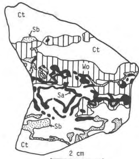
Fig. 2. Sketch of the studied sarabauite-bearing specimen. Sa: sarabauite; Sb: stibnite (with minor senarmontite); Wo: wollastonite; Ct: calcite.

In the sarabauite structure (Nakai et al. , 1977), the