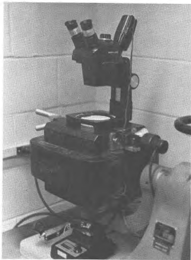
Fig. 2. Experimental configuration of microscope and Frantz Isodynamic Magnetic Separator used in magnetic-fluid method of density determination. Forward tilt of separator = 0^\circ , side tilt = 90^\circ .

By successively examining a series of standards, a