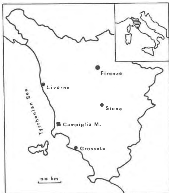
Fig. 1. Location map of the Campiglia Marittima mine, Tuscany, Italy.

tufted aggregates of tiny lath-like crystals (Fig. 2) of a pale blue color, associated with gypsum and sometimes with small amounts of brochantite and antlerite. Often campigliaite and gypsum are closely mixed; however campigliaite appears grown on gypsum crystals (Fig. 3). The genesis of campigliaite is probably related to the sulfate solutions formed by the oxidation of pyrite and other sulfide minerals. The presence of manganese in campigliaite is related to ilvaite. According to Rodolico (1931) ilvaite from Campiglia has 9.5% MnO which is a very high content for this mineral.