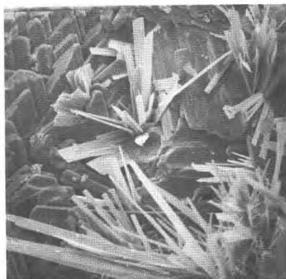
Fig. 3. Scanning electron photomicrograph of crystals of campigliaite grown on gypsum. Crystals are about 0.2 mm long.

A wet chemical analysis, attempted on a small amount of purified material (less than 1 mg) confirmed the previous results for Mn, Cu and Zn (atomic absorption spectrometry). Unfortunately the scarceness of available material did not allow us to obtain reliable results for the SO 4 content. A TGA analysis, performed in order to obtain the H 2 O content, was also unsuccessful.