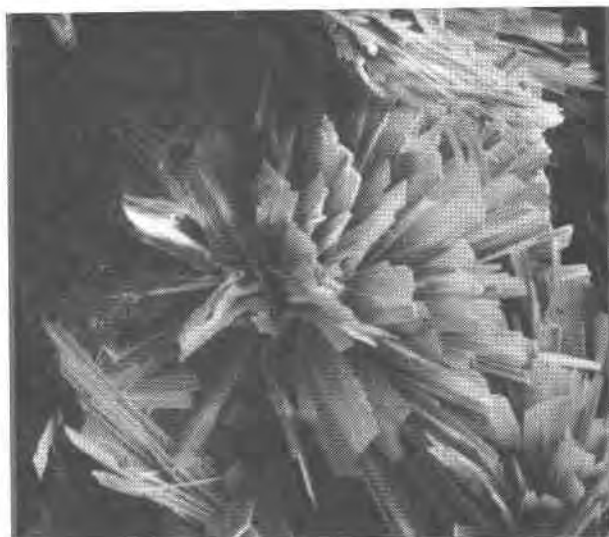
Fig. 2. Scanning electron photomicrograph of tufts of campigliaite. Crystals are about 0.2 mm long.

Preliminary qualitative analyses of campigliaite, made with an ORTEC X-ray microanalyzer, revealed the presence of Cu, Mn, Zn, S and no other element with atomic number greater than 11. Many quantitative analyses were carried out by means of an ARL SEMQ electron microprobe using chalcopyrite, sphalerite and hortonolite as standards. It is important to note that these analyses were done under unfavorable conditions, since campigliaite crystals are very tiny and decompose under the electron beam. The average values of the three best analyses, MnO 9.95, CuO 40.60, ZnO 4.47, SO 3 20.15, H 2 O 24.83% (by difference), correspond to