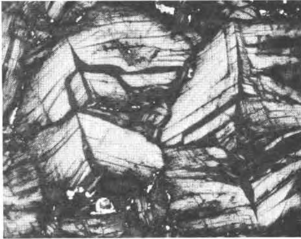
Fig. 2. Coyoteite crystals showing chevron pattern developed by opposing cleavage sets. Continuous parallel lines are polishing scratches. The long dimension of the photograph is 0.26 mm.

these values are low because of minor contamination by epoxy resin along the cleavage lamellae. The calculated density is 2.879 \text{ g cm}^{-3} for Z = 2 . Coyoteite is moderately magnetic.