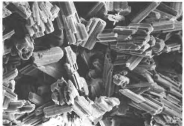
Fig. 2. SEM photomicrograph showing aggregates of perroudite crystals from Broken Hill, New South Wales. The crystals average about 0.025 mm long.

For the Broken Hill mineral, analyses were obtained using a JEOL electron-microprobe operating at 15 kV and with a specimen current of about 0.013 \mu A. Under these conditions, surface damage was minimized, but the count rate for Hg was very low (100 cps). Only single crystals mounted in epoxy resin and then polished could be ana-