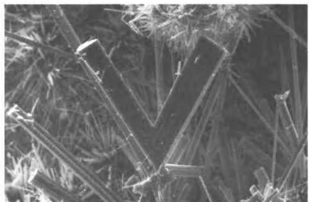
Fig. 3. SEM photomicrograph of a contact twin of perroudite from Cap-Garonne. Each arm of the twin is 0.08 mm long.

A comparison of the analytical data in Tables 1 and 2 reveals the following: (1) The Cap-Garonne perroudite is quite uniform in composition, whereas the Broken Hill